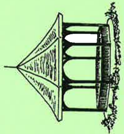
The 1913 Bandstand

13 Site of bandstand. In 1913 a splendid new bandstand was built here; the opening ceremony included speeches by the Lord Mayor and Mr Arnold Rowntree, MP, and much music.