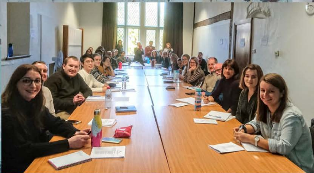
Heritage Planning Studio students

The Civic Trust has a number of specialist advisors who support our work. One of the most active is our Transport Advisory Group which brings together 16 separate organisations and individuals from across the transport spectrum. This expert resource led the Civic Trust to publish its Transport Strategy for York in 2022, a document that has provided a solid foundation for the City of York Council as it develops its new Local Transport Plan.