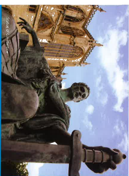
Statue of Constantine

Life in Roman York wasn't all Emperors and Empresses. What was life like day after day for the regular folk, both soldier and civilian, who lived right here nearly two thousand years ago? Find out as we walk in their footsteps. Where did they come from? What did they eat? Where did they live? How did they keep clean? And how, ultimately, were they laid to rest?